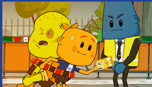
THE GOLDEN TICKET